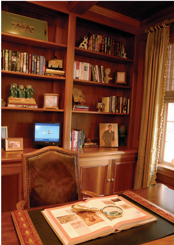
At left: Jean Helfrich's office displays rich mahogany woodwork including built-in bookcases, detailed paneled walls, and a coffered ceiling. At right: (top) Beautiful painted tiles surround the living room fireplace; (bottom) a cozy corner for chess affords a lovely view of the backyard.

Each room has been carefully designed and built so that clutter is kept to a bare minimum, and everything has a place. In the living room—the family's media center—an