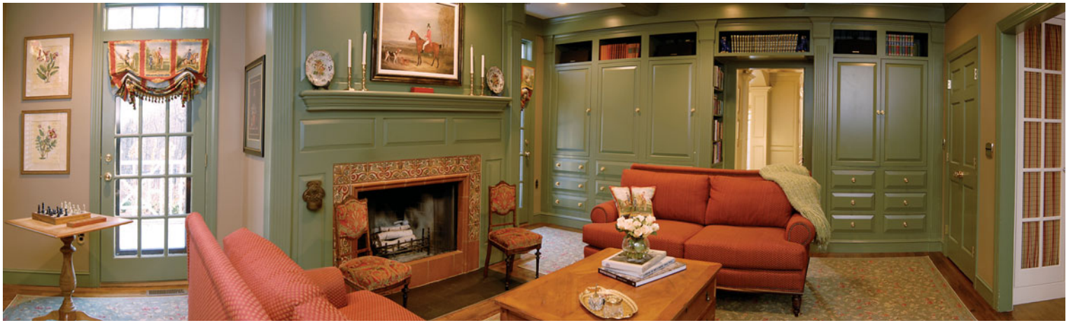
The Helfrich's warm and inviting living room, nestled between the office and kitchen area, features a wall of built-ins that hides a TV and stereo, among other things.

Both businesses have evolved and grown over the years, and the Helfrichs and DiSalvos continued to remain in touch even long after their football days were over.