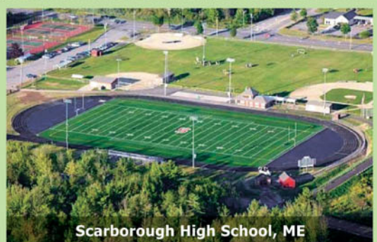
Scarborough High School, ME