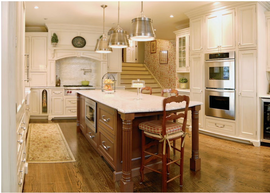
The "hub" of the Helfrich's home, the kitchen features extensive custom cabinetry, a large center island where the family most frequently gathers, and an Old World style alcove that houses a stove top and was built to resemble a fireplace.

entire wall of built-in cabinetry hides the television, DVD player, and surround sound components for both that room and the new sunroom. Drawers and shelving store compact discs and movies and display neat rows of leather-bound books. Pridecraft also created a custom mantel piece and coffered